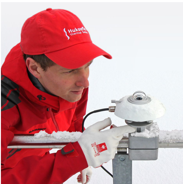
Figure 4 SR25 accelerating sublimation of snow, here shortly after snowfall

SR25 has a sapphire outer dome, glass inner dome and an internal heater. It employs a state-of-the-art thermopile sensor with black coated surface and an anodised aluminium body. The connector, desiccant holder and sun screen fixation are very robust and designed for long term use.