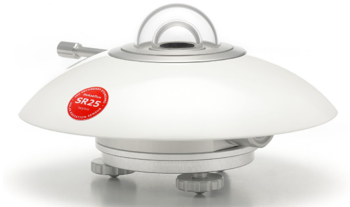
Figure 1 SR25 secondary standard pyranometer

SR25 takes solar radiation measurement to the next level. Using a sapphire outer dome, it has negligible zero offsets. SR25 is heated in order to suppress dew and frost deposition, maintaining its measurement accuracy. When heating SR25, the data availability and accuracy are higher than when ventilating traditional pyranometers. SR25 needs very low power. Patents on the SR25 working principle are pending.