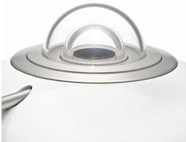
Figure 6 SR25's sapphire outer dome takes solar radiation measurement to the next level