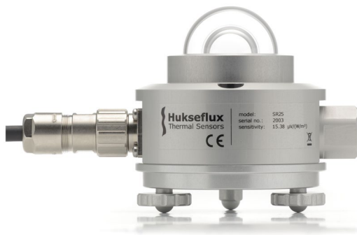
Figure 3 SR25 pyranometer with its sun screen removed

SR25 measures the solar radiation received by a plane surface, in \text{W/m}^2 , from a 180^\circ field of view angle. SR25 offers the best measurement accuracy: the specification limits of two major sources of measurement uncertainty have been greatly improved over competing pyranometers: "zero offset a" and temperature response.