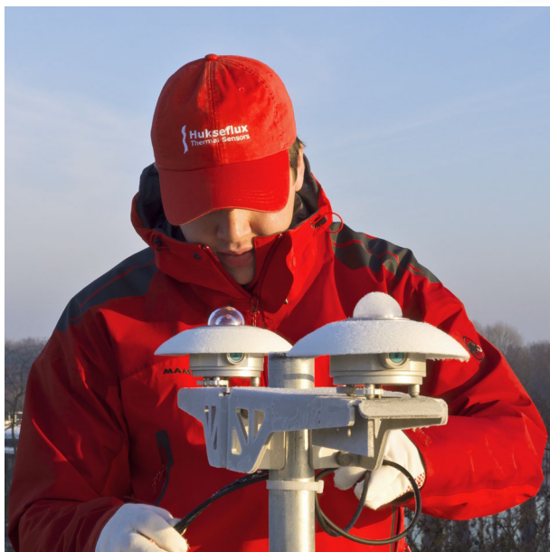
Figure 2 frost deposition: clear difference between SR25 (left), versus a non-heated pyranometer without sapphire dome (right)